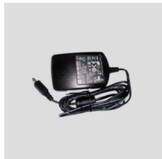
Adapter AC Cable