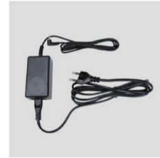
Adapter AC Cable